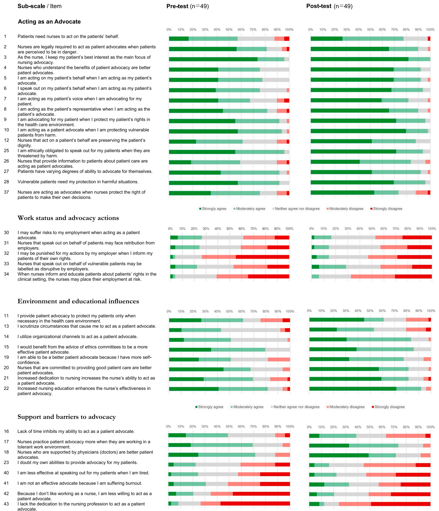
Fig. 2. Pre-test post-test change in PNAS.

student-led drama in their interprofessional pedagogy.