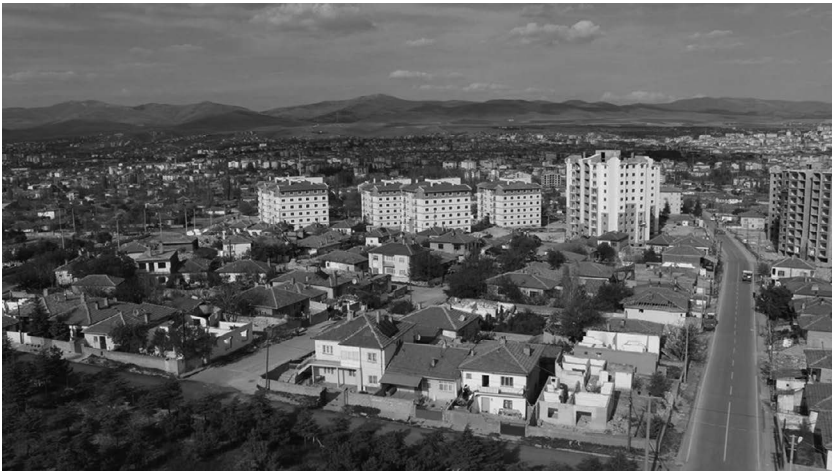
Image 3.1 Bağbaşı neighbourhood: Abdals’ settlement and the new TOKI blocks behind them.

Bağbaşı consisted of one- or two-storey detached houses with attached small gardens of trees (Image 3.1). 3 Mostly, streets were settled by people