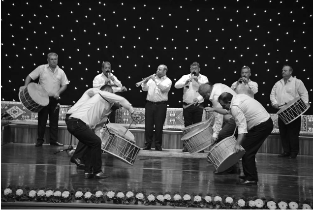
Images 3.2 and 3.3 Abdal Musicians from Bağbaşı.