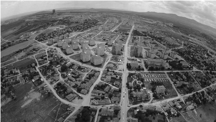
Image 3.4 Most common housing typology in Bağbaşı and TOKİ Blocs.

A more serious issue was that the renewal process did not include any consideration of the socio-economic situation of residents, or the cultural values sustained by the existing spatial environment. The project only aimed to provide property owners with better housing conditions in a modern urban environment. But while this was done, most of them had to take loans, as the value of the new houses was higher than the previous ones. Apart from providing home-owning residents with the options of buying the newer apartments, no further circumstances of the residents or potential consequences were considered. Tenants living on rent were displaced with no compensation. Property owners lost businesses and thus sources of income. Socio-economic relations and the local community networks that underpinned them were destroyed (see the disconnect between the traditional two-storey houses and the new high-rise apartment buildings in Image 3.4 ). Daily life practices and rituals were