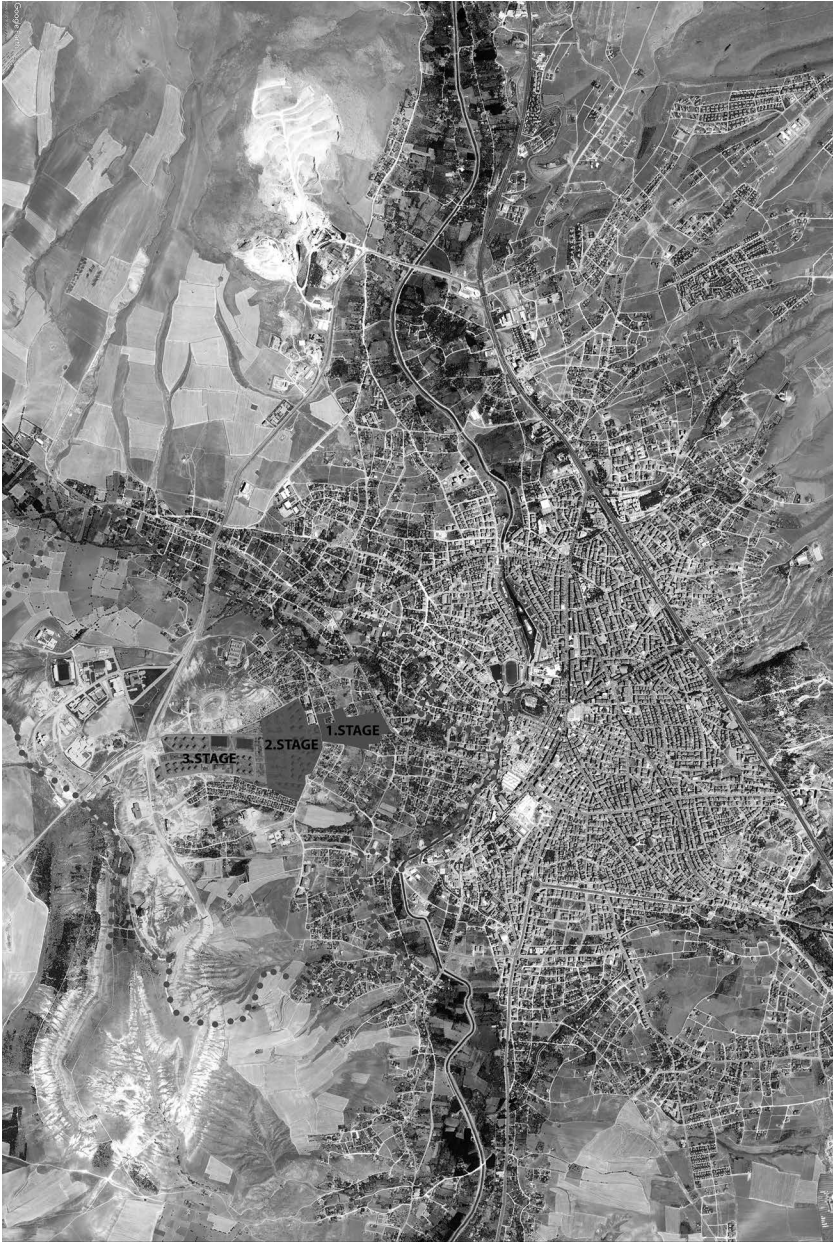
Map 3.2 Map shows the project area in the neighbourhood boundary.