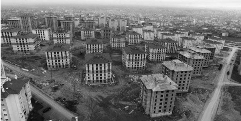
Image 3.5 The construction of the new TOKI apartments.