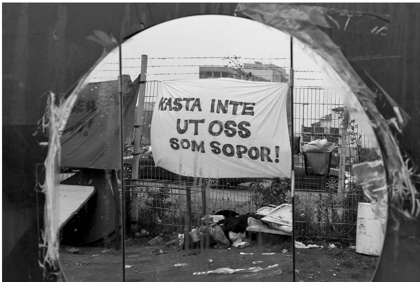
Image 7.1 Banners to protest the pending demolition (Photo by Jenny Eliasson, Malmö museer (with permission from the photographer)).

In the afternoon on November 1, 2015, hundreds of people gathered at the site of the settlement. Some were there to protest the pending demolition. Others, hostile to the squatters, had gathered to celebrate the City’s actions. Frayed banners hung from the chain-link fence that surrounded the settlement. One of them read in bold black letters ‘Don’t throw us out like trash!’ (see Image 7.1 ).