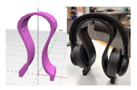
Figure 2: Headphones holder intended for daily use by a workshop participant

The least attractive topics for design seemed to be related to science projects and the creation of tools. The surveys revealed that both boys and girls participants would prefer to use 3D printers for projects related to fun activities and to fabricate missing or broken parts of existing products. After such projects, the workshop participants seemed to appeal the most to projects associated with their hobbies, including fashion design, sports and music.