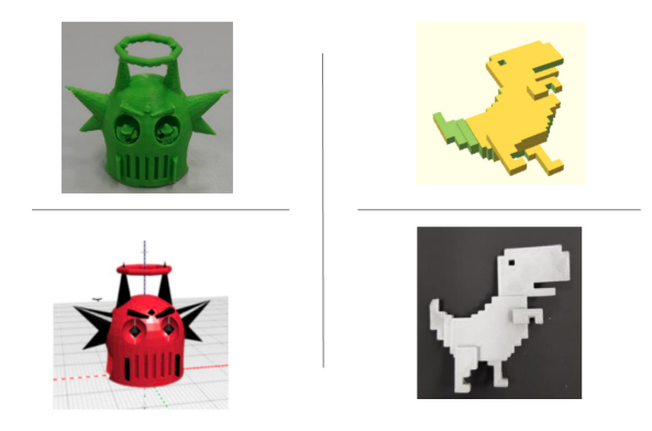
Figure 1: Fun projects of workshop participants

The analysis of the surveys showed that, in general, the favorite projects of the workshop participants were related to entertaining activities and practical objects for their daily life like missing or broken parts of products, followed by projects related to fashion.