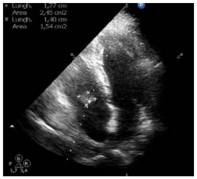
Figure 1. Preoperative trans-thoracic echocardiography showing a single mass in the right atrium in continuity to the tricuspid valve

The right atriotomy was closed, the aortic clamp was removed, and the patient was weaned from cardiopulmonary