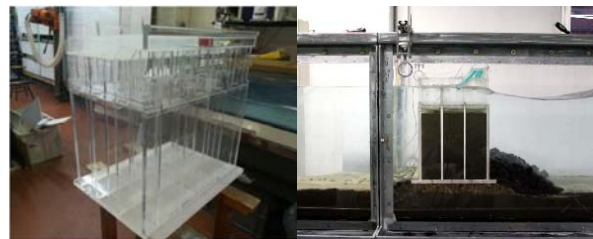
Figure 2 - ARPEC model tested in the random wave flume