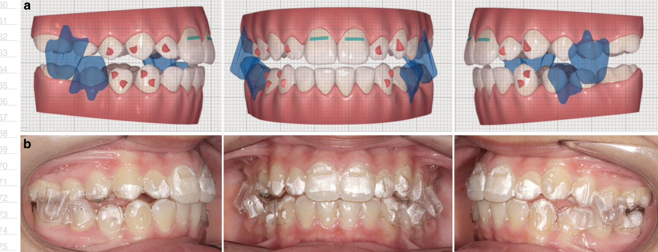
Fig. 2 Frontal and lateral views of a mandibular advancement (MA) appliance: a Clin-check plan and b intraoral viewAbb. 2 Frontale und laterale Ansichten einer Unterkiefervorschubapparatur (MA): a Clin-Check-Plan und b intraorale Ansicht

the first permanent molars, and 0.030-inch ball clasps (or arrow clasps) were positioned in the interproximal spaces anteriorly. The precise clasp arrangement depended on the state of the dentition at the moment of TB construction. In the mandibular arch, Clark suggested placing ball hooks in the interproximal areas between the canines and incisors [18].