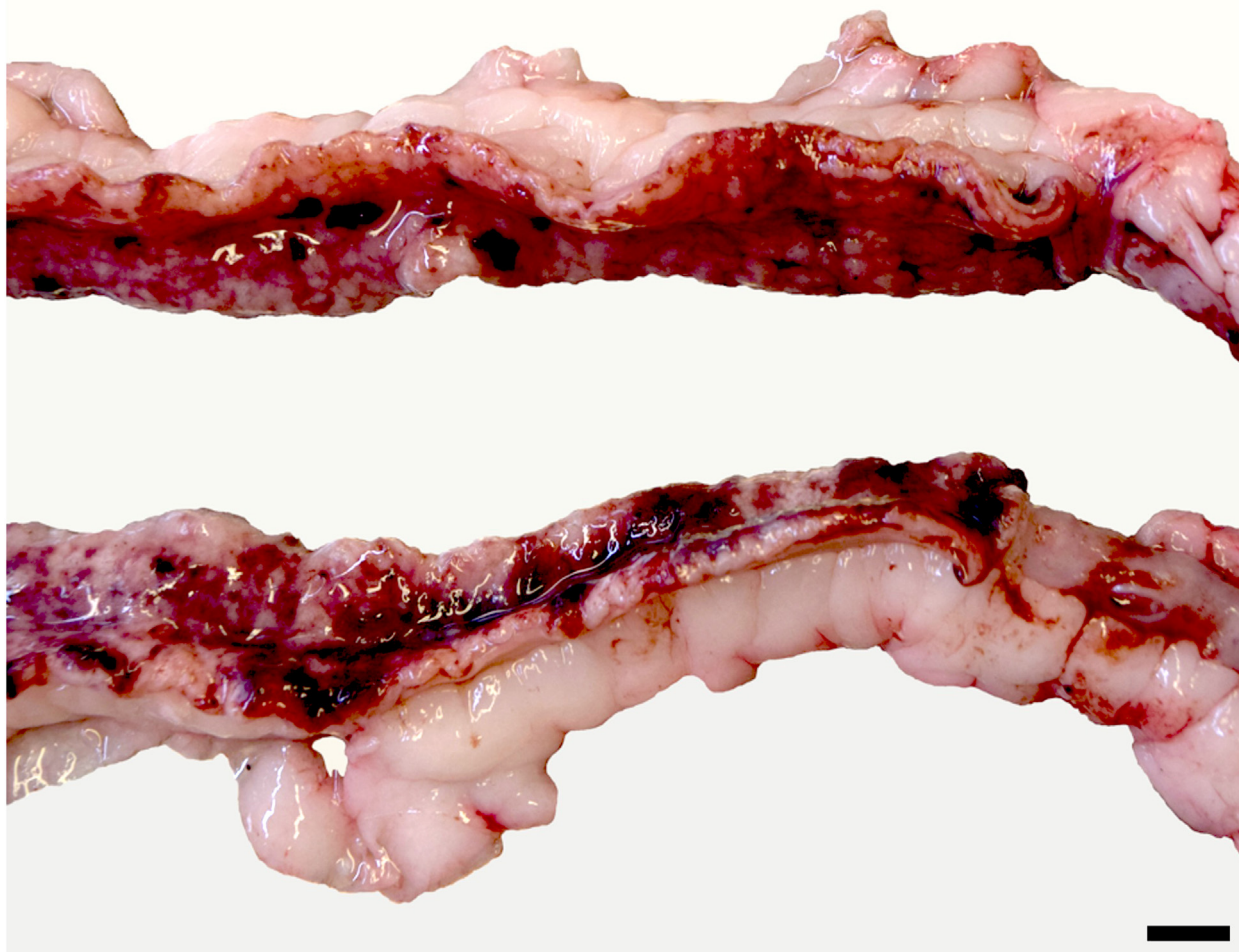
Fig. 2. Enteritis, Campylobacter jejuni , small intestine, cheetah. Moderate diffuse thickening and multifocal reddening of mucosa. Bar, 1 cm.

6.0 × 1.0 μm), staining dark brown to black with WS stain and morphologically compatible with Helicobacter spp, were present on the mucosal surface and in the lumen of gastric glands. The small and large intestines had numerous multifocal areas of necrosis with flattening and loss of enterocytes, loss of crypts and infiltration with numerous neutrophils as well as fewer lymphocytes and plasma cells (Fig. 3). The remaining mucosal and crypt epithelial cells were often hyperplastic and the crypt lumina were dilated and filled with cell debris and neutrophils, forming crypt abscesses. Numerous curved, spiral or gull-wing-shaped rods (up to 4.0 μm × 0.5 μm), stained dark brown to black with WS stain and were present multifocally on the mucosal surface and in crypt lumina (Fig. 4). The morphology of these bacteria was consistent with Campylobacter spp. Based on the pathomorphological findings, the following main diagnoses were made: (1) moderate to severe, necrotizing and neutrophilic enterocolitis with intralesional curved to spiral bacteria (compatible with Campylobacter spp); (2) moderate, focally-extensive, chronic gastritis with intralesional helicoidal bacteria (compatible with Helicobacter spp) and multifocal ulcerations, focal gastric perforation and subsequent focal