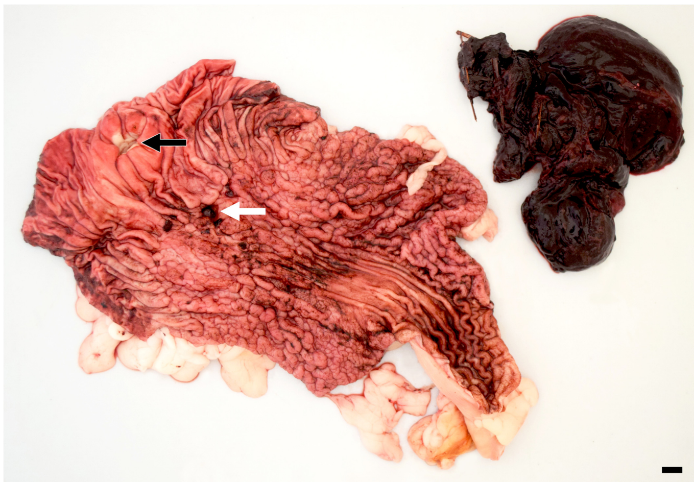
Fig. 1. Gastritis, Helicobacter pylori , stomach, cheetah. Diffuse, moderate thickening and reddening of gastric mucosa with a 1 cm diameter perforating ulcer (white arrow) 5 cm caudal to the cardia (black arrow). Blood clot (upper right) removed from gastric lumen measured 10.0 \times 7.0 \times 3.0 cm. Bar, 1 cm.

Histological examination of the stomach revealed perforation of the deepest ulcer with transmural infiltration of large numbers of neutrophils and fewer other leucocytes, with immature granulation tissue formation. The remaining non-ulcerated mucosa had moderate multifocal infiltration of lymphocytes and plasma cells in the lamina propria. Abundant, narrow, helicoidal rods (up to