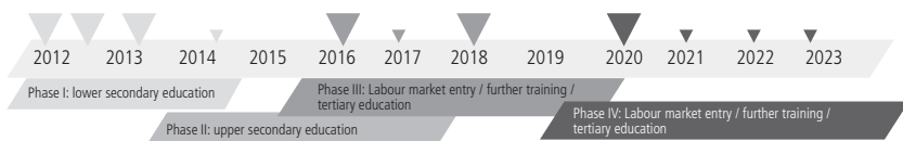
Figure 1 Timeline DAB panel study: Survey waves with measurement of aspiration emphasised

Vocational aspirations and occupational expectations were measured repeatedly throughout the DAB panel study. In the first three waves, while still enrolled in lower secondary education, students were asked to state what profession they would like to pursue later on . In the fifth, seventh, and eighth waves, respondents were asked to specify the profession they think they will be working in at the age of 30 . At these time points, respondents had graduated from compulsory schooling three, five, and seven years earlier.