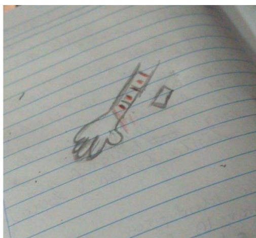
Figure 4. Drawing of self-harm as a manifestation of depression by a young adult.

Other frequently reported manifestations were self-harm for anxiety in adolescents and depression in one young adult (see Figure 4) as well as behaviors of defiance and opposition to authority figures in the family, school, and neighborhood as a symptom of depression and anxiety among both age groups. Yelling and avoiding social interactions also reflected depression and anxiety, respectively.