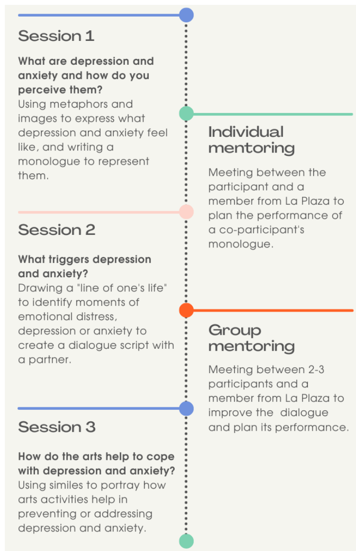
Figure 1. Outline of the dramaturgy-based workshops.