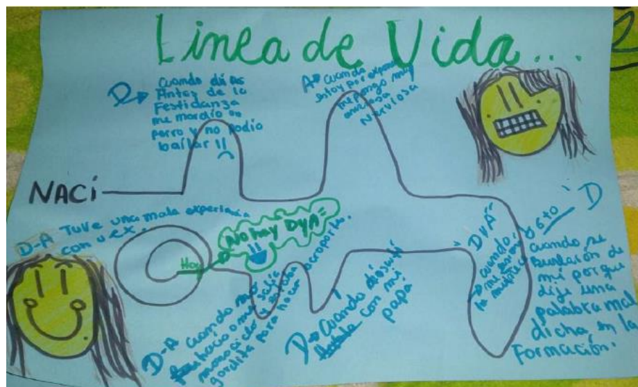
Figure 6. Lifeline of a female young adult including events that triggered depression or anxiety.

Other events identified as anxiety and depression symptom triggers included migration or changing houses and being physically distant from relatives. Situations related to difficulties in the relationship with parents such as constant arguments or distant relationships were also linked to depressive symptoms for both age groups (see Figure 6).