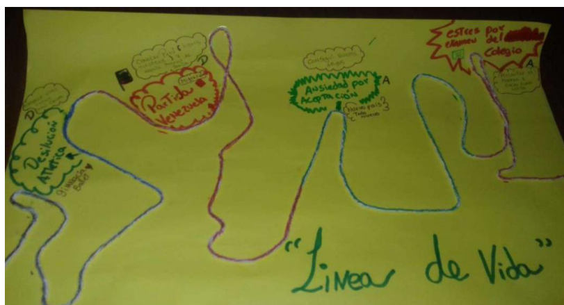
Figure 3. Lifeline drawn by a male adolescent.

Finally, the participants wrote eight narrations (four by adolescents and four by young adults) about the events identified in the lifelines, detailing actions, people, spaces/contexts, and times of the onset of symptoms in the plot of the narration. These elements made it possible to identify the triggers of the symptoms of anxiety and depression and the underlying and consequent factors to these, in addition to the different types of associated symptoms.