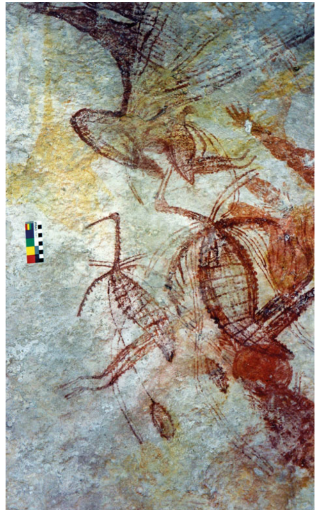
Figure 2. Yam Figure style back-to-back birds, Deaf Adder Gorge, Arnhem Land.

A single depiction of a two-headed thylacine-like creature can also be found in a rock-shelter in Kakadu National Park. It has a head at each end rather than a head and hindquarters (Fig. 4). At Djuwarr, in Kakadu National Park's Deaf Adder Gorge, there is a large, solid red painting of a Rainbow Serpent that has a snake body, human-like head, breasts, an arm and a leg. Two small back-to-back male human figures stand in the middle of her looped snake body (Fig. 5). The composition relates to a very important story about the Rainbow Serpent Ancestral Being swallowing two boys and