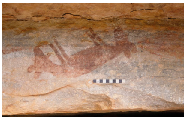
Figure 4. Double-headed 'thylacine' rock painting, Kakadu National Park.

(Chaloupka 1993, 188, fig. 209), a second composition by Nayombolmi of a 'split man' (Nakurrurndilhba) back-to-back figure about to have intercourse with a normal female figure, two back-to-back malevolent female spirits at Nanguluwurr, Kakadu (Hayward et al. 2021, 422, fig. 11) and back-to-back human female figures and birds at a number of Awunbarna (Mount Borradaile) sites. There are also large back-to-back macropods of unknown age at Djidbidjidbi (Mount Brockman, Kakadu), Djarrng (Taçon et al. 2021) and elsewhere, as well as two back-to-back macropods holding dilly bags and sticks about six kilometres north of Lightning Dreaming in the middle of Kakadu. Macropods holding these material culture items are associated with the mythological origin of the Wubarr ceremony (see e.g. Goldhahn et al. 2021). Maddock (1970) interpreted rock paintings of back-to-back male and female kangaroos at Gudabubi:m