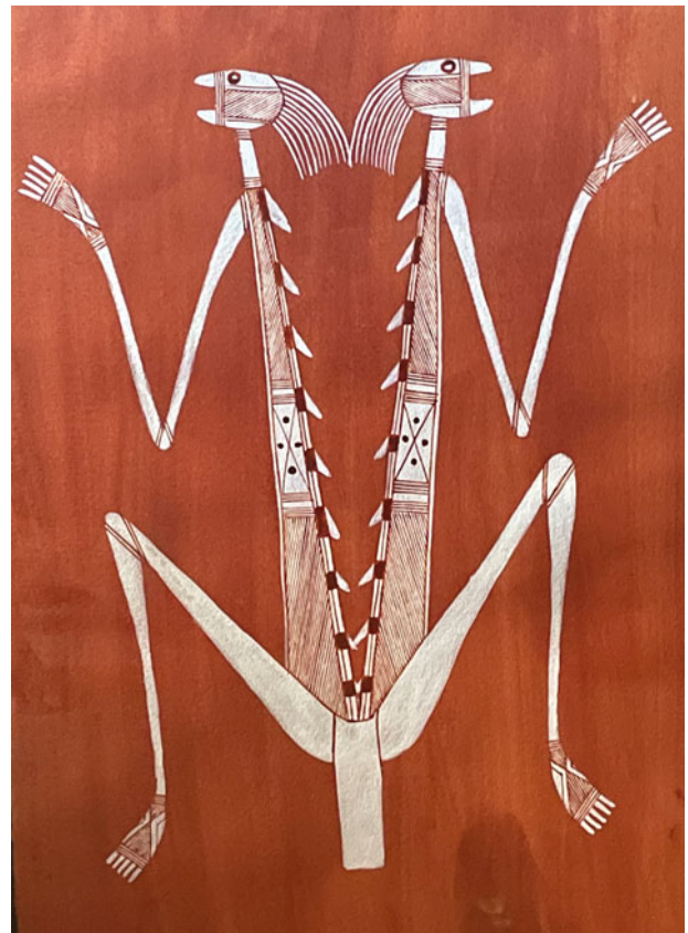
Figure 11. Robert Namarnyilk's 'Ancestor: Split Man , a Nakurrurndilhba or clever figure' (Paul S.C. Taçon collection. Photograph: Paul S.C. Taçon.)

Back-to-back animal or human figures are also rare in world rock art, but a few notable exceptions include the spotted horses of Peche Merle (Clottes 2008, 86–7), a single pair of back-to-back bison at Lascaux (Clottes 2008, 118–19) and one set of back-to-back rhinos at Chauvet (Clottes 2008, 45), all in French caves. In the Stadsaal Caves (Matjiesrivier) of the Cederberg region of South Africa there are two sets of back-to-back elephants painted in solid orange-red (Penn-Clarke et al. 2020, 5, fig. 4C). These back-to-back animal paintings convey a sense of power, but they also are unusual in that they are isolated examples rather than part of a long tradition. Back-to-back animals also appear in superimpositions such as at the Cussac Cave's 'Grand Panel' in the Dordogne region of France where back-to-back bison are placed over a pair of back-to-back horses, an occurrence that Feruglio et al. (2019, 10) suggest is part of a 'narrative'. On the other hand, animals and humans facing each