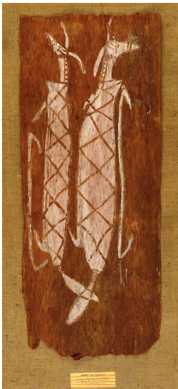
Figure 8. Paddy Cahill bark painting of back-to-back Rainbow Serpents, collected in 1922. (Courtesy Museums Victoria, museum number X28762).

an important local story that is also imprinted on the landscape for the early collectors Baldwin Spencer and Paddy Cahill.