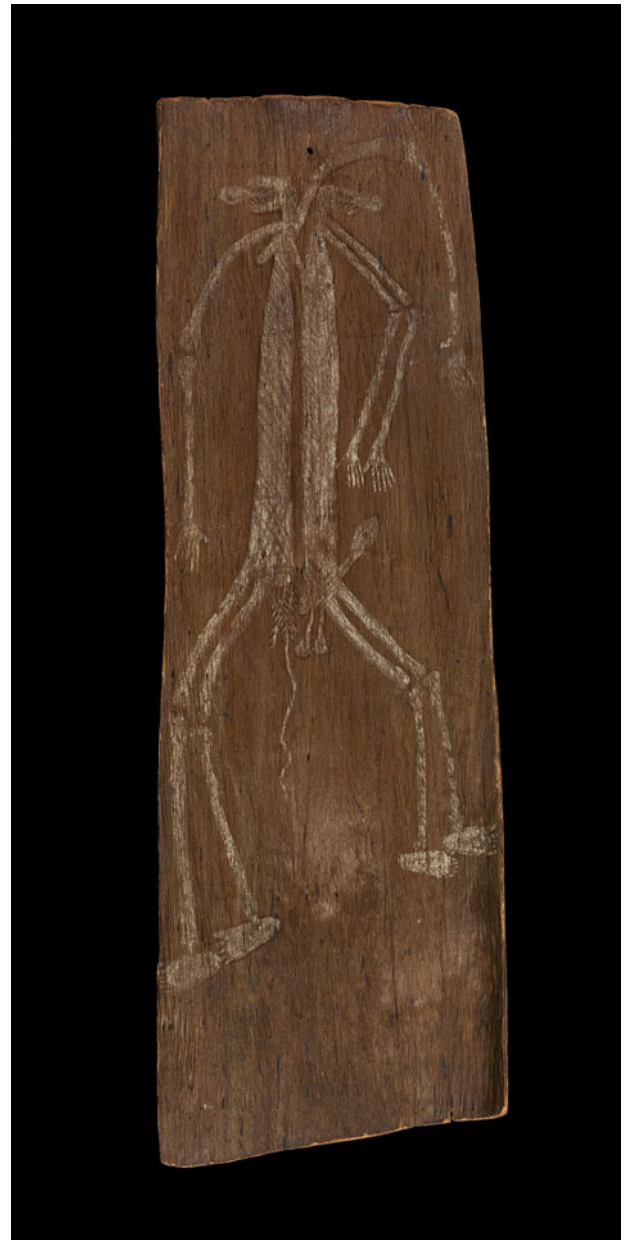
Figure 7. Early 1800s bark painting with back-to-back male and female figures. (Courtesy of the British Museum, museum number Q73.Oc.17.)

The next oldest bark painting (Fig. 8) is from the 1922 Spencer/Cahill Collection in Museums Victoria, collected in the East Alligator River area (museum