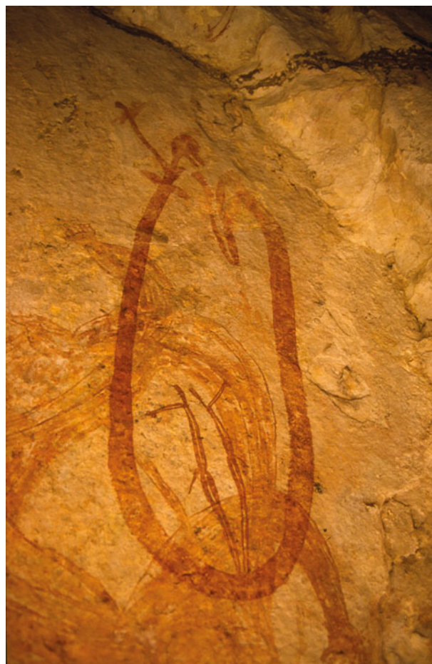
Figure 5. Djuwarr Rainbow Serpent with back-to-back human male figures, Deaf Adder Gorge, Kakadu National Park.

(Chaloupka 1993, 188, fig. 209), a second composition by Nayombolmi of a 'split man' (Nakurrurndilhba) back-to-back figure about to have intercourse with a normal female figure, two back-to-back malevolent female spirits at Nanguluwurr, Kakadu (Hayward et al. 2021, 422, fig. 11) and back-to-back human female figures and birds at a number of Awunbarna (Mount Borradaile) sites. There are also large back-to-back macropods of unknown age at Djidbidjidbi (Mount Brockman, Kakadu), Djarrng (Taçon et al. 2021) and elsewhere, as well as two back-to-back macropods holding dilly bags and sticks about six kilometres north of Lightning Dreaming in the middle of Kakadu. Macropods holding these material culture items are associated with the mythological origin of the Wubarr ceremony (see e.g. Goldhahn et al. 2021). Maddock (1970) interpreted rock paintings of back-to-back male and female kangaroos at Gudabubi:m