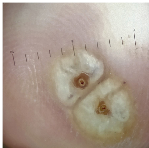
Figure 2 Dermoscopy revealed a white halo of hyperkeratosis and a dark central orifice surrounded by a white ovoid structure.

0001-7310/© 2022 AEDV. Published by Elsevier España, S.L.U. This is an open access article under the CC BY-NC-ND license ( http://creativecommons.org/licenses/by-nc-nd/4.0/ ).