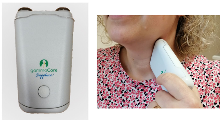
Fig. 1 ElectroCore's gammaCore nVNS device (left) and demonstrated use (right) with the device applied to the left side of the neck

The risk associated with the use of the gammaCore® nVNS device is minimal, and the safety profile is strong. The most common adverse events reported include local