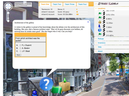
Fig. 1 StreetLearn user interface

Based on Street View as a front-end component, the StreetLearn game engine [6] is designed as a simulated location-based game combining locations, objects, players, and tasks in a 3D-environment representing the real world. Players as well as all objects and tasks are associated with a specific location on the map. The game starts at a specific location, where players are confronted with an initial task description. Typical tasks comprise finding locations, finding/taking objects, retrieving information, and answering questions. Solving a task leads to scores and usually a follow-up task. Players can be organised in competing teams that share tasks. Teams gain a team score, but individual players also score individually. Typical examples for StreetLearn games comprise scavenger hunt games, location-based quiz-rallies, or exploration games.