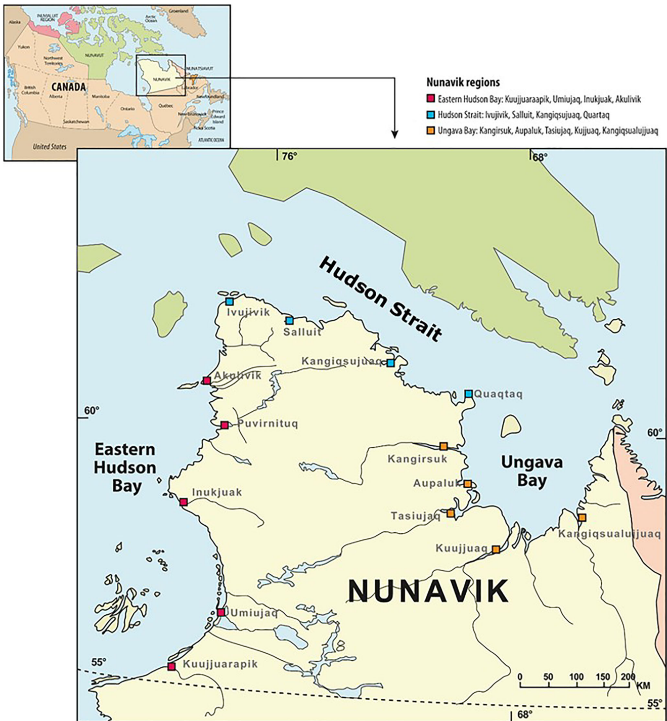
Fig. 1 Map of Nunavik, northern Quebec, Canada

(2) one to three times a month; (3) once a week; (4) two to six times a week; and (5) daily. The last two categories were dropped because several food items were not reportedly consumed more than once per day, and this was leading to problems with model convergence. Sensitivity analyses were performed using dichotomous dietary variables (below and above the median) to ensure model stability (data not shown).