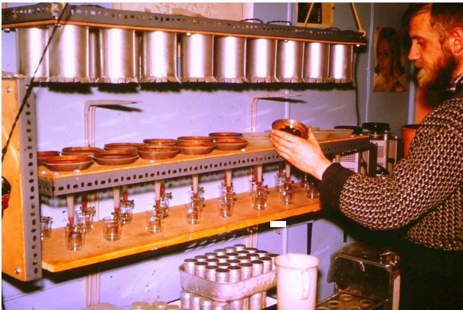
Loading soil and plant samples for heat extraction of nematodes (this apparatus required continuous 24 hour electrical power which hitherto had not been available at Signy station!)

At Signy Peter undertook one of the first detailed studies of the moss turf ecosystems abundant throughout the maritime Antarctic, which later formed the core of his successful PhD thesis in 1974. This fundamental work showed the composition of the micro-arthropod and nematode populations of typical moss habitats on the island at that time. The results formed the basis of future ecological studies in what was to be a structured programme of research in terrestrial biology on Signy island.