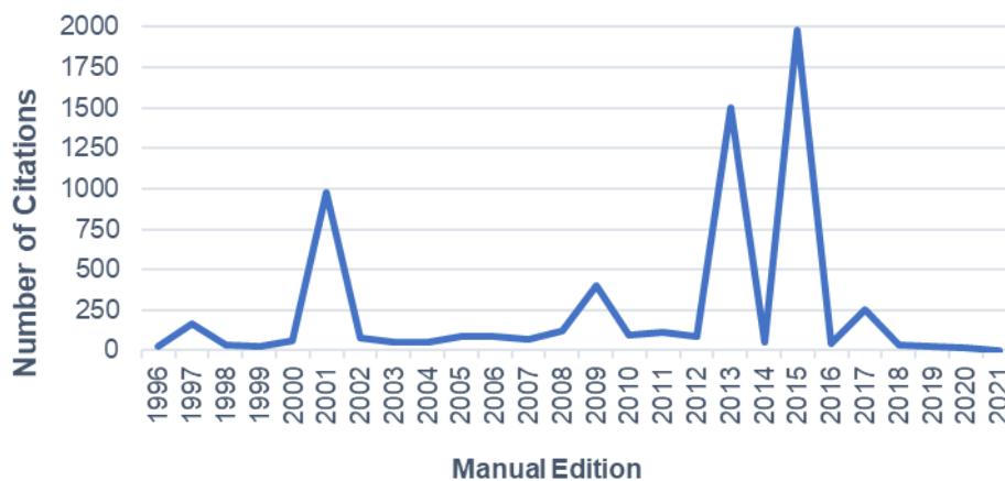
Figure 2: Forward citations, Unit Cost of Health and Social Care

Forward citation searching. To support our understanding of how the Unit Cost Manual is being used by stakeholders in the UK and globally, we will complete a search of forward citations using widely recognised online literature search facilities. These searches will enable us to understand the number of citations of the Unit Cost Manual by year, a list of primary authors who commonly cite the Unit Cost Manual, types of studies using the Manual, and the most active countries and regions utilising the Manual. A preliminary search of forward citations suggests the Unit Cost Manual was cited at least 6,450 times since its inception 30 years ago. The data was accessed from the websites The Lens and Google Scholar on 22.8.22 using the term Unit Costs of Health and Social Care (no citation information was available for years prior to 1996) with some editions of the Manual cited more frequently than others (Figure 2).