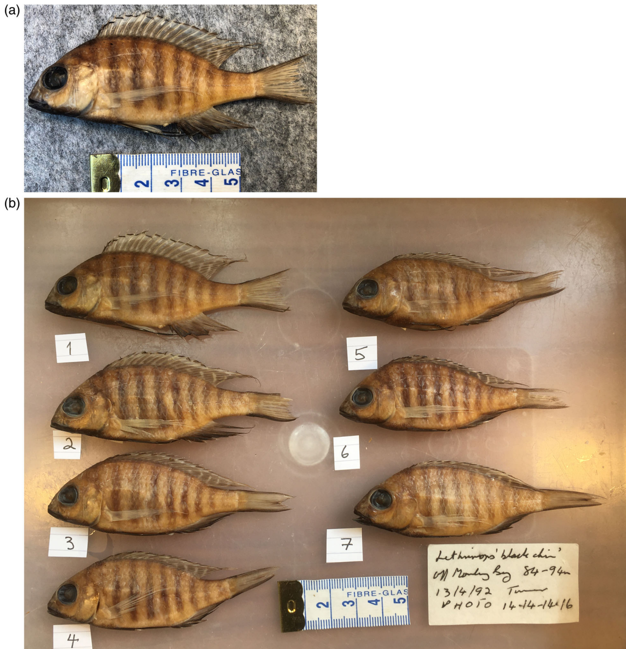
FIGURE 1 Lethrinops atrilabris sp. nov. Above: holotype: BMNH April 20, 2022.1, male, 72 mm SL (standard length), collected from trawl catch NE of Monkey Bay, at a reported depth of 84–94 m, 13 April 1992; Below: the full type series, holotype labelled 1, collecting information as holotype

transition into a cycloid state. Scales on chest are relatively large, gradually transitioning in size from larger flank scales, as is typical in non-mbuna Malawian endemic haplochromines (Eccles & Trewavas, 1989). A few small scales scattered on the proximal part of caudal fin.