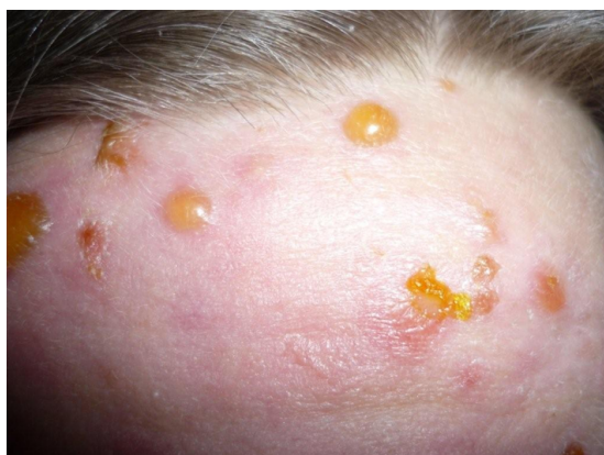
Figure 1: IgA-epidermolysis bullosa acquisita. Development of vesicles and bullae on the previously eruption-free facial area, after treatment with hydroxychloroquine.

We saw the patient in October 2009. Serology for Borrelia burgdorferi was strongly positive and these results were confirmed by a positive IgG and IgM blot. She was treated with doxycycline 100 mg twice daily for four weeks with no improvement. Treatment with hydroxychloroquine was started without a beneficial effect. Because of progression of the lesions in the facial area (Figure 1) dapsone 100 mg was started. A biopsy showed a subepidermal blister with a