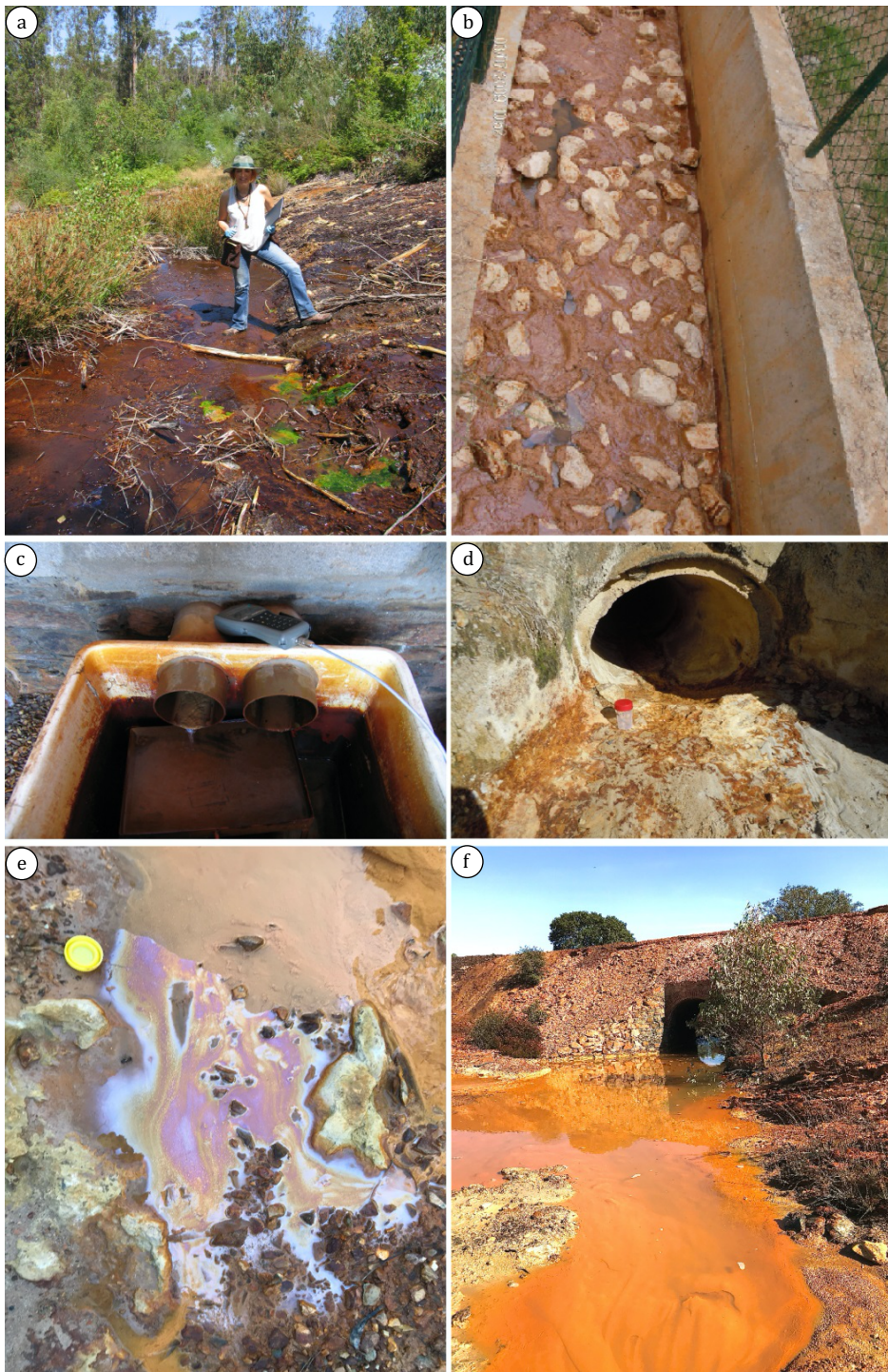
Figure 1 Images of the sampling sites. a – Receiving stream of AMD from Valdearcas waste-dumps (NW Portugal); b – limestone channel in the passive treatment system of Jales mine (N Portugal); c – discharge of ARD from shallow groundwater in Serro (NW Portugal); d – discharge of AMD from Penedono waste-dumps (NE Portugal); e – stream affected by AMD in Campanario mine (Iberian Pyrite Belt, Spain); f – Receiving stream of AMD from São Domingos mine (Iberian Pyrite Belt, Portugal).