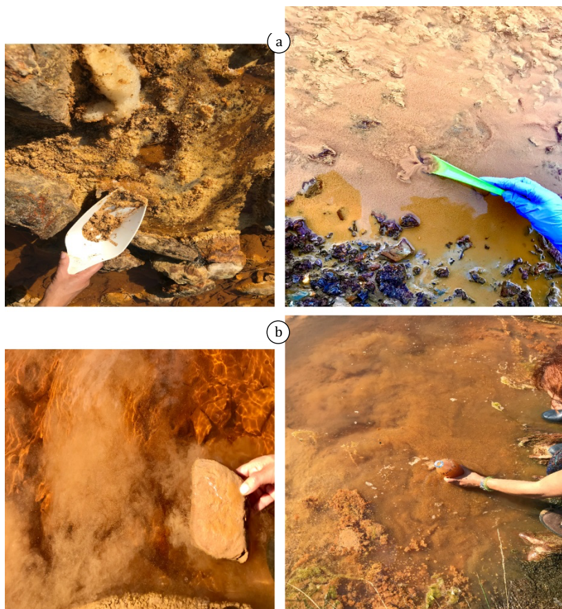
Figure 2 Sampling of precipitates in Acid Mine Drainage. a) Scrapping the substrate and b) slight agitation of the water for obtaining the flocculated material (fluffy precipitates).

The precipitates were collected at the bottom of the streambeds and in artificial structures, like drainage tubes, and limestone channels in passive systems. Fig. 2 shows sampling procedures, such as directly scrapping the substrate and collection the suspended flocculated material. These fluffy