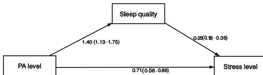
Figure 2. Mediation effect of sleep quality in the association of PA levels and stress level. PA level: physical activity (0 = low physical activity; 1 = moderate physical activity; 2 = high physical activity). Sleep quality: 0 = Poor; 1 = Good. Stress level: Low stress = PSS Scores < 14; Moderate stress = PSS Scores 15 to 26; High stress = PSS scores \geq 27 . Mediation analysis adjusted for age, gender, race, and years teaching. Results expressed in odds ratio and 95% confidence intervals.

We further tested the mediation of the sleep quality in the association between PA level and perceived stress level adjusted for age, gender, race, and years teaching. We found a direct effect of PA engagement on perceived stress levels (OR = 0.71; 95%CI = 0.56–0.86; p < 0.001 ); however, this association was partially mediated by sleep quality (indirect effects: OR = 0.62; 95%CI = 0.42–0.82; p < 0.001 ; mediation proportion = 72.1%). The mediation model showed a good fit ( X^2 = 55.9 , p < 0.001 ) and lower AIC (1684.8) and BIC (1729.3) than the model without a mediation path (AIC = 1738.8; BIC = 1778.8; Figure 2).