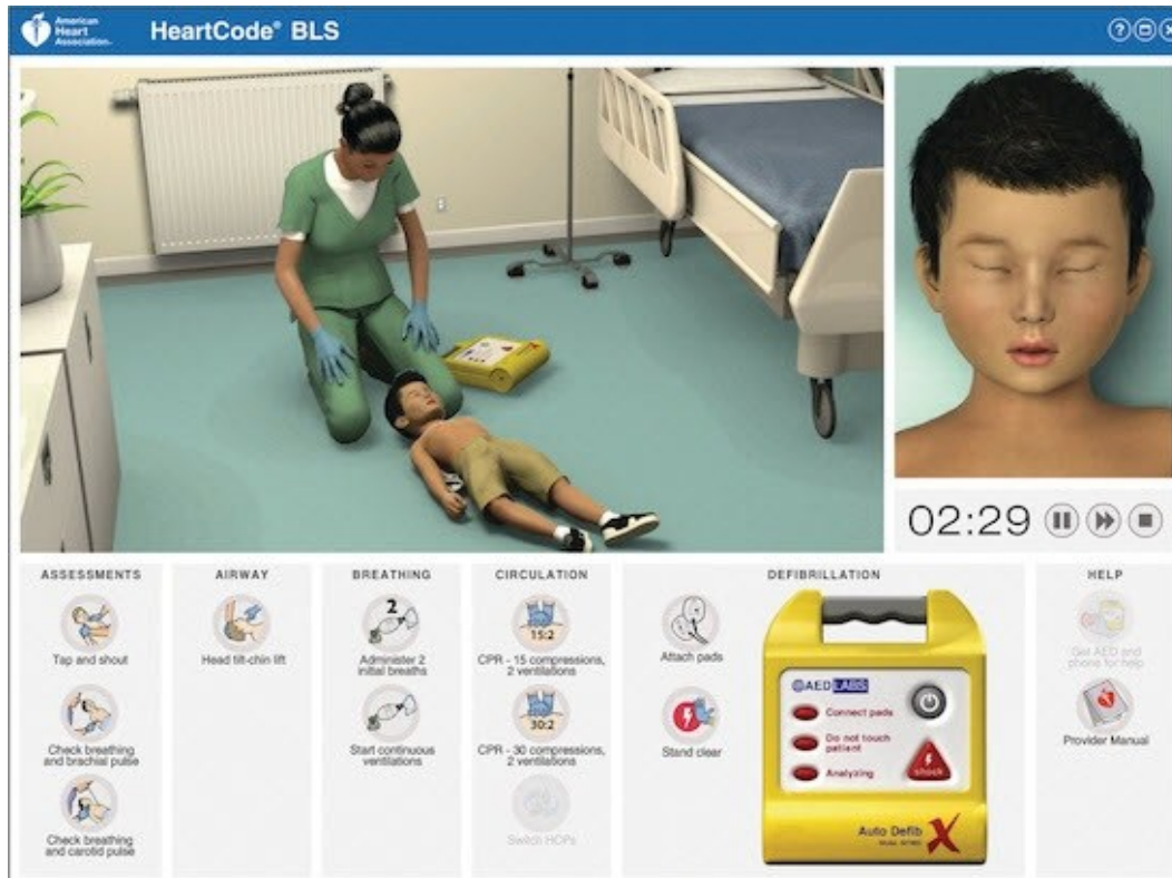
Figure 1 American Red Cross BLS Simulation

Note. modified from https://www.youtube.com/watch?v=7S7fjRYSsN8