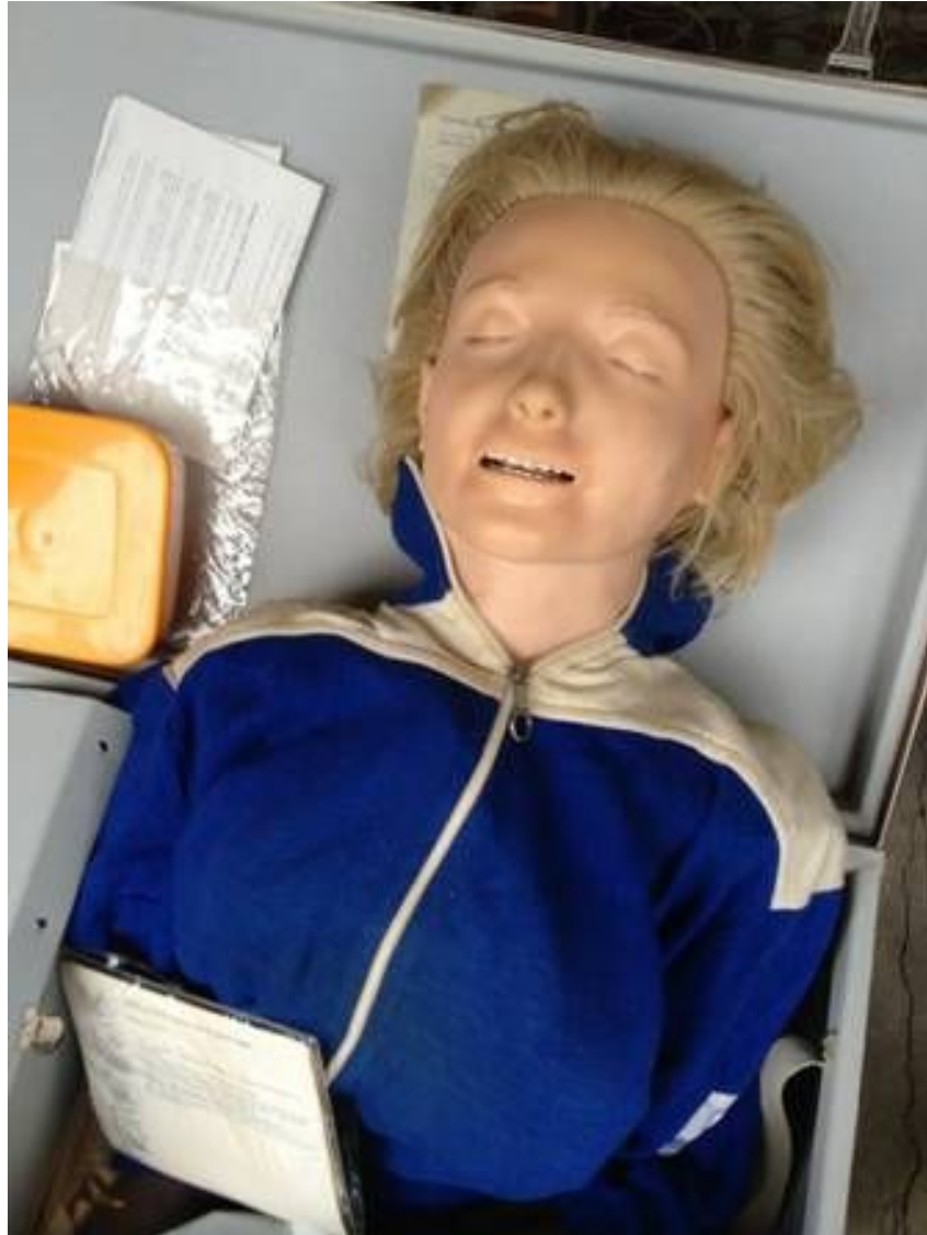
Figure 6 Vintage Laerdal Rescue Annie

Note. The first simulation system to train and practice cardiopulmonary resuscitation life saving procedures (and was the inspiration for Michael Jackson) (modified from https://www.wcbe.org/arts-life/2021-09-21/the-most-kissed-girl-in-the-world ).