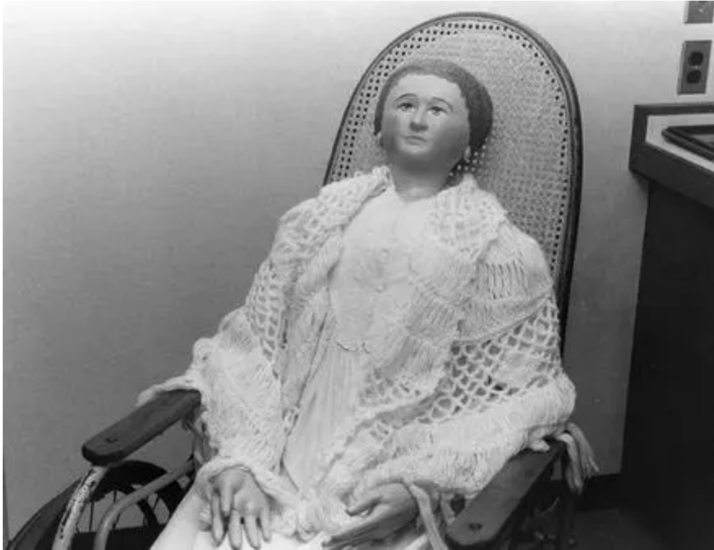
Mrs. Chase human mannequin

Note. The Mrs. Chase human mannequin was a life size doll that allowed for training and practice (Photo credit Hamilton Archives at Hartford Hospital).