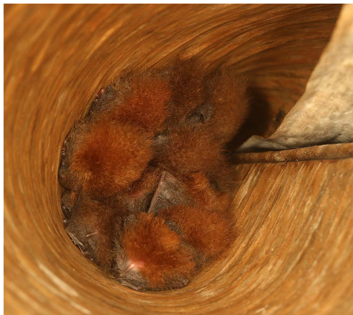
Figure 4. A colony of perhaps 9 Thyroptera discifera roosting in a portion of a dead banana leaf. This is the same plant identified in Figure 2 above and the bats were roosting in the top cone shown by the white arrow. Photograph taken near La Paloma Lodge, Drake Bay, Costa Rica on 4 November 2021.

neath dead banana leaves or inside shelters formed from such leaves. In areas where bananas are grown, it may be especially difficult to find discifera roosting in association with native plants. The finding of a wynneae inside a dead Cecropia leaf shelter similar to the dead banana leaf cones described here may indicate one sort of situation that discifera may be found in.