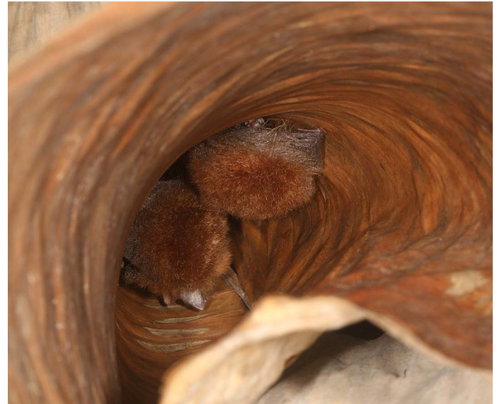
Figure 3. Two Thyroptera discifera roosting in a portion of a dead banana leaf. There had been additional bats in that cone earlier in the evening, but they had already exited. Photograph taken near La Paloma Lodge Drake Bay, Costa Rica on 20 February 2021 by Gómez.

It stayed there for one day. The main conical roost was lopsided with length 50 cm on one side and 40 cm on the other (Figure 3). Height from ground to entrance was 169 cm with roost opening 20 cm wide. The cone that was occupied for one day by a single bat and that was beneath the other cone was of about the same dimensions. Although the bats were not handled, the number occupying the roost varied from only 2 to 5 some days to perhaps 10 or more on others.