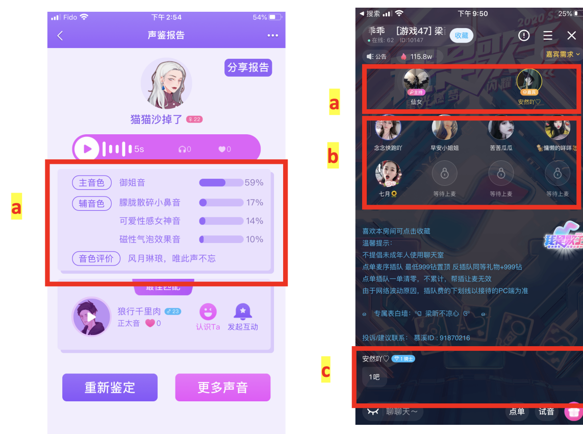
(A) A page which displays an evaluation of the voice of a paid teammate showing a) main voice factor, secondary voice factors, and a comment on the voice by the evaluation