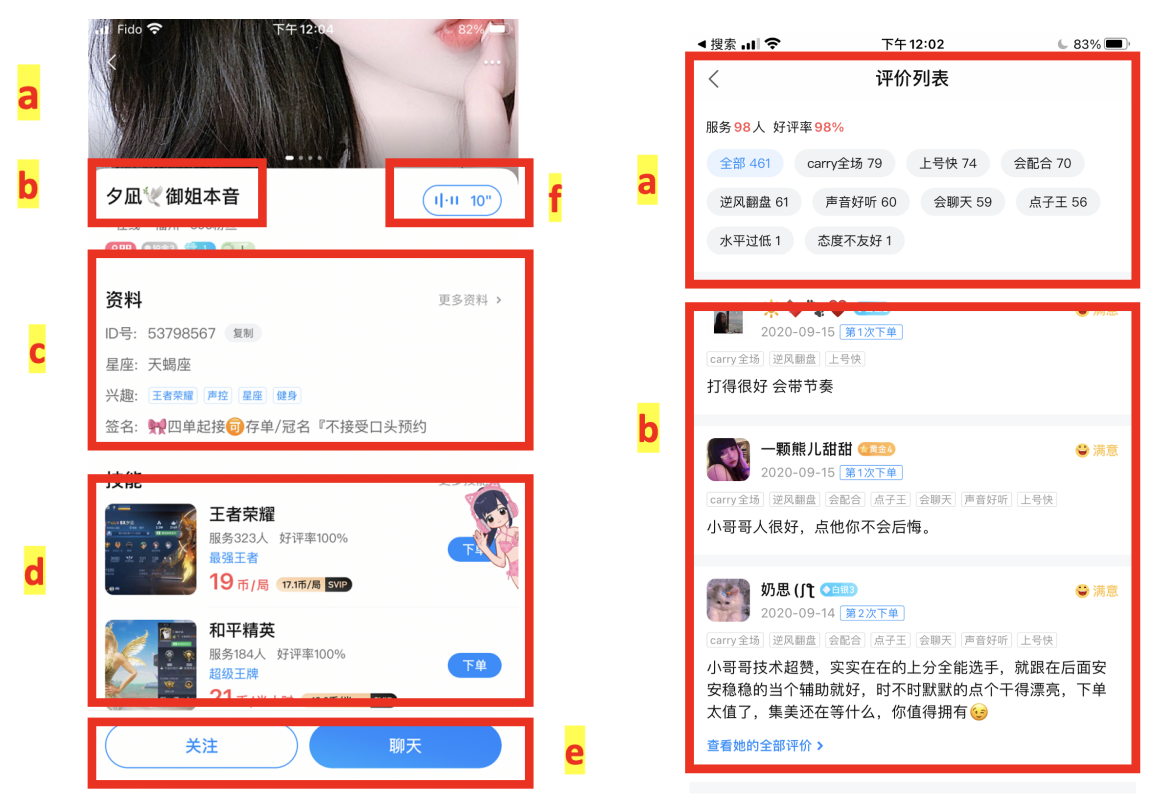
(A) A profile of a paid teammate: a) A selfie; b) Name on Bixin. This paid teammate chose to add her voice type behind her name, which is "mature lady voice"; c) Gaming profile; d) The games she plays e) chat with her by clicking the blue button; f) a button to play a clip of the voice of the paid teammate