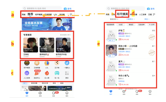
Figure 1: Left: The main page of Bixin, which contains: (a) buttons to "same city" page and popular game sections, which are: PUBG mobie, Kings of Honors and LOL; (b) Top 3 recommended paid teammates for a gamer; (c) all other game sections. Right: (d)All of the recommended paid teammates under a game section, (e) a list of recommended paid teammates.

5.2.3 Story Space in Bixin. Story space is used as a mechanism to further enhance the character portrayed by the profile, and thus acted as a self-advertisement mechanism. By observing the Story Space of the paid teammates' recommended to the researcher in