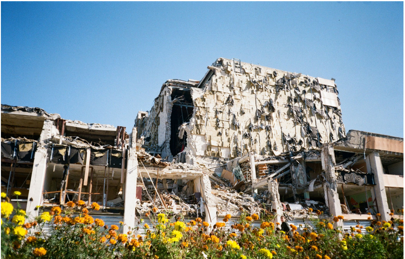
Lozova Palace of Culture, damaged in a missile strike on May 20, 2022.

and sound equipment. Staff members were also not able to save any books. 105