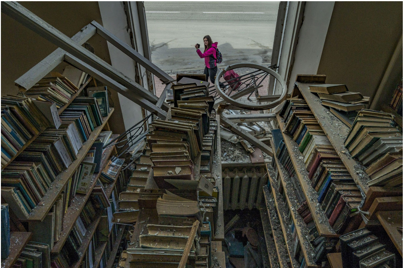
The Chernihiv Regional Youth Library, damaged by a bombing on March 11, 2022.

politician, and publicist, Vyacheslav Chornovil. 117 As a defender of Ukrainian cultural rights and free expression, Chornovil publicized the Soviet repression of Ukrainian intellectuals in 1966; headed the Ukrainian Helsinki monitoring group; edited the Ukrainian Herald , an illegal underground newspaper; and was head of the Ukrainian national-democratic liberation movement in the late '80s and '90s. Chornovil was sentenced to Soviet prison three times before emerging as a prominent political leader after Ukraine's independence. 118 The National Union of Journalists reported that significant parts of Chornovil's archive were lost, as well as books from the Chornovil Foundation and 60 copies of the complete works of Chornovil. Nearly all of the archives of Mykola Plahotniuk, a fellow dissident, located in the same house, were also destroyed. 119