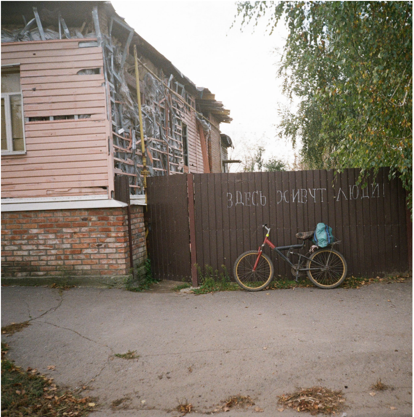
Graffiti on a gate in Iziium: "Humans live here." October 9, 2022

As the Ukrainian government, its international allies, and multilateral institutions plan for the future phases of this war and its aftermath, cultural vitality and continuity should be an explicit point of emphasis, aiming to ensure that Russia's war on Ukrainian culture does not succeed.