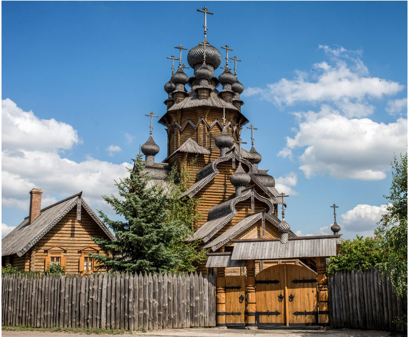
The historic wooden All Saints' church in the Donetsk region before it was destroyed on March 12, 2022.

repeated attacks between March and June. 97 According to the Ukrainian Orthodox Church, at the time of an air attack on March 12, 520 people were sheltering at the monastery and some were injured by shrapnel. 98 The historic wooden All Saints' church in the complex was burned completely, apparently having been struck by artillery. 99 Ukraine's Minister of Culture Oleksandr Tkachenko said that there were monks and nuns, as well as about 300 others, seeking shelter in the complex at the time of the strike. 100