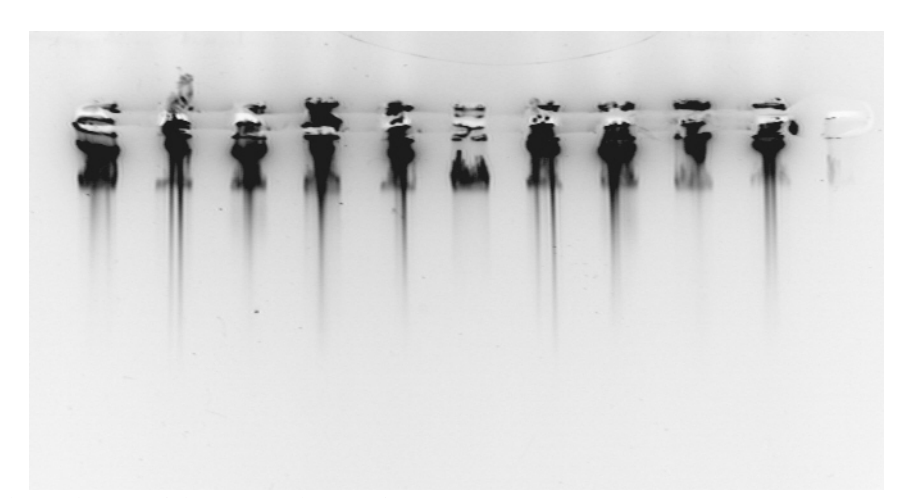
Fig. 1. Agarose gel electrophoresis of chromosomal DNA of strain ST3

ATB System (Bio-Mérieux), the strain ST3 was classified as Pseudomonas putida . The percentage of identification (Id%) was 99.8 (Tasić et al., 2008).