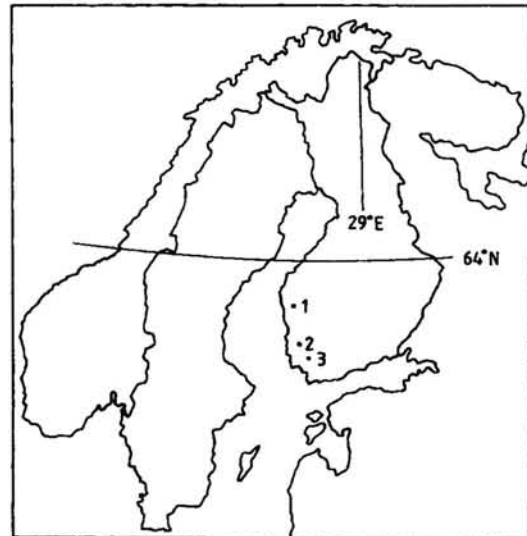
1. RÄVÅSEN 2. HIITTENHARJU 3. KIRJUNAJU

The National Board of Antiquities carried out excavations at Rävåsen in 1994–1998 in a future gravel pit area of almost 2 hectares. A total of over 1,000 square metres of the site was investigated, which, however, is less than 5% of the area stripped for sand and gravel excavation and an even smaller proportion of the whole area of finds. Approximately 30 round or oval depressions were discovered in the southern parts of Rävåsen