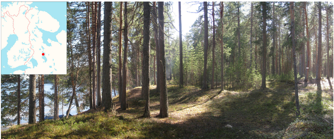
Fig. 1. The location of Pegrema (upper left) and an overview of the Pegrema I site, photographed from the northern end of the excavated area. Photo & illustration: K. Nordqvist.

The strainer from Pegrema I consists of numerous pieces (e.g. 784/1681, 1682, 1685, 1688, 1689, 1690, 1692, 1693, 1694; collections stored at the Institute of Linguistics, Literature