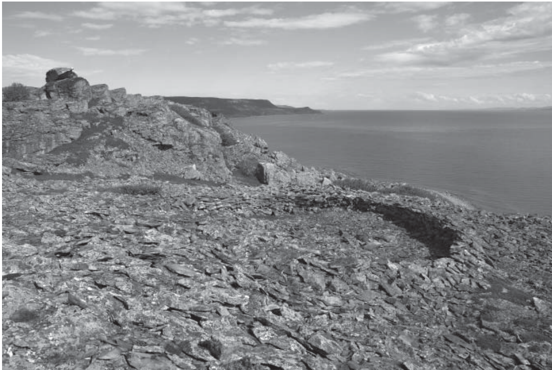
Fig. 2. A sacrificial enclosure (to the right) at the pre-Christian cemetery at Mortensnes/Ceavccegeadge, Varanger, Finnmark, northern Norway. The famous sacred Bear Stone is in the background (the outcrop, upper left). Photograph by A. Svestad 2006.

(Fig. 2). Proximity to water (by a river or on an island) was particularly important for the placing of a cemetery in Eastern Sámi areas (Storå 1971: 197; Luk'jančenko 1985: 202–3). This characteristic is probably related to the belief that a burning river named Tolljohk separated the living from the dead. 4 According to the ethnologist Nils Storå (1971) the Eastern Sámi believed that in order to reach 'the heavenly paradise' the dead person had to cross Tolljohk on a narrow bridge from which many fell into the river. They could be saved by Pedar and his wide meshed net, but that depended on making the sign of the cross correctly. Those who succeeded could enter the kingdom of the dead on the other side of the river. Those who did not, fell through the net and remained in the river forever. Storå notes that 'the mention of a heavenly paradise seems to suggest that the Skolt [Eastern Sámi] ideas of a realm of the dead situated on the other side of a river have been mixed up with Christian concepts' (Storå 1971: 197). Similar characteristics are shared with pre-Christian Karelians and other peoples. Water was a manifestation of the border