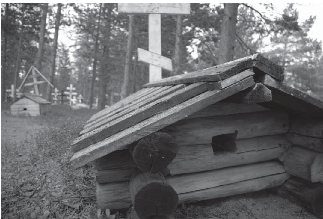
Fig. 5. Aperture for the soul. Burial house of an Eastern Sámi grave dated to the late 1950s, Sevettijärvi orthodox churchyard, northern Finland.

above as an exit or passage of the soul (or spirit). The custom was still practiced in the orthodox churchyard of Sevettijärvi in northern Finland in the late 1950s (Fig. 5). It may be argued that