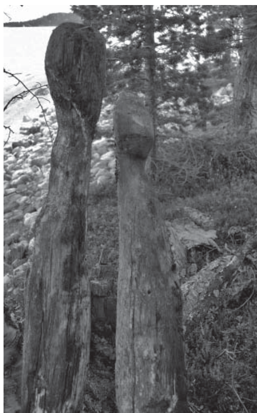
Fig. 3. Two wooden idols, Hietasaari churchyard, Lake Inarijärvi, northern Finland.

cf. Halinen 2007; Mannela 2007). On the middle of the tree a wooden cross arm was attached to form a cross in Christian times, but both the cemetery and the sanctuary are supposedly older than the church (Manker 1961; cf. Halinen 2007). Another illustrative example is the churchyard at Hietasaari (Sandy Island) in Lake Inarijärvi, also in northern Finland. This churchyard was established in 1793 and closed down as late as 1905 (Arponen 1993). On a survey in 2005 the author documented very well preserved but hitherto unknown remains of two wooden sieidis next to Christian graves from the turn of the 20th century (Fig. 3). 7 The circumstances indicate that the idols were in use at the same time as the cemetery, and possibly to its very end. Possible pre-Christian graves were also documented on the western outskirts of the cemetery (cf. Arponen 1993). Both the above-mentioned examples strongly indicate the 'continuation' of Sámi religious conceptions and practices long after the end of conversion. The