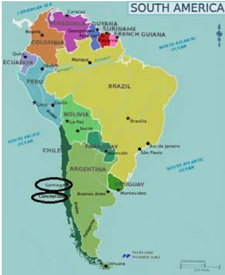
Map 1. Chile

Note: The cities of Santiago and Concepción are encircled.