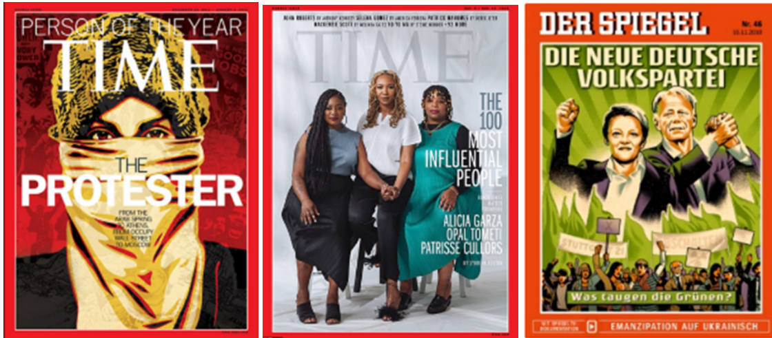
Figure 9. Female leadership covers (left: Stengel, 2011c; center: Felsenthal, 2020c; right: Mueller von Blumencron & Mascolo, 2010d).