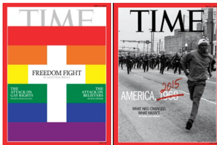
Figure 12. Polarization in Time (left: Gibbs, 2015a; right: Gibbs, 2015b).

Time also used polarization as a frame for specific causes, but not as a general commentary on the transformation of the realm of formal politics (Figure 12). This was the case of a cover depicting the LGBTQ movement as a fight between religious faith and human rights (Gibbs, 2015a). The historical movement for racial equality also evoked oppositions—such as protesters versus police, or White cop/Black cop—although such oppositions were positioned against the American dream of equality and justice rather than the danger of political polarization.