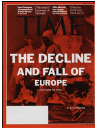
Figure 10. Violence on covers (Stengel, 2011b).

Other covers connected protest to polarization, marking it as potentially dangerous to the social fabric. The two covers dealt with the rise of the extreme right. Der Spiegel used a photograph of a street demonstration, with protesters' salute and black hoodies juxtaposed to the figures of two dark-haired children wearily watching them from behind the curtains of a household window (Figure 11). In an issue titled "Hate in America" (Gibbs, 2017), Time illustrated the surge in White supremacy with an illustration of man's silhouette raising the American flag in a patriotic gesture reminiscent of the Nazi salute. Both covers conveyed the idea of hate against the Other as an illegitimate driver of protest.