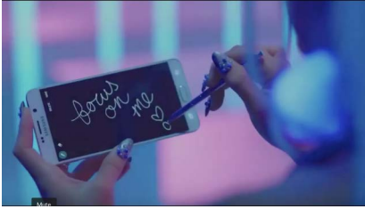
Figure A1: First occurrence of the Samsung Note 5 in Ariana Grande’s “Focus” music video.