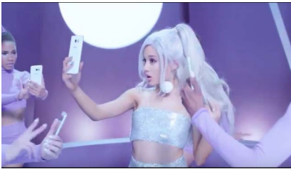
Figure A2: Second occurrence of the Samsung Note 5 in Ariana Grande’s “Focus” music video.