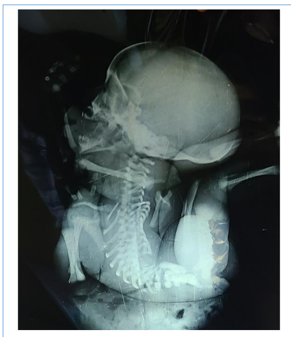
Plate 3: X-ray examination of foetus at delivery. The pelvis and lumberspine were distorted

There is an increased risk of foetal anomalies in multiple pregnancies. Compared with singleton pregnancies, monozygotic pregnancies have a higher incidence of ventral body syndromes [13]. However, BSA is rare in monozygotic twins and even rarer in monoamniotic twins [9]. Our case report adds to the few cases documented in literature where most of the monozygotic twins are discordant for this anomaly [11]. No known definitive pathophysiology thoroughly explains BSA [7]. However, three theories have been proposed: early amnion rupture, circulatory insufficiency early in embryonic life, and abnormal germ disc theory. The rupture of amnion theory postulates that amnion rupture leaves the chorionic surfaces exposed to subsequent amniotic bands that cause traumatic injury to the foetus [13]. The circulatory