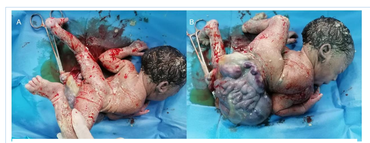
Plate 2: Macroscopic examination of the foetus with BSA