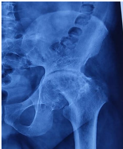
Figure 2: Stage III

Indications of THA are refractory pain, disability and radiologic evidence of damage in hips, regardless of age. 4,5 When painful degenerative changes occur in the hip, (THA) has been shown to alleviate pain and improve function in AS patients. 11 Total hip arthroplasty in AS patients is a challenging procedure owing to multiple factors. The approach and exposure of the hip can be difficult due to the presence of an ankylosed joint. There is a risk of implant malposition due to sagittal plane malrotation of the pelvis. Bone quality is affected by disuse osteopenia, resulting in an increased risk of fracture and there is a subsequent risk of re-ankylosis of the joint after arthroplasty. 12,13 The success of total hip replacement is the outcome of the surgery that enables to relieve the pain associated with the hip joint pathology with maintaining the mobility and stability of the hip joint for