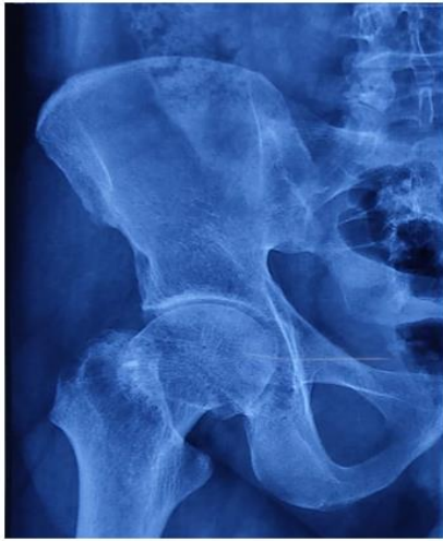
Figure 1: Stage II.

they have a limited role in treating advanced established arthritis of the joints and hip problems. 8-10 Standard treatment option for advanced hip disease is total hip arthroplasty (THA).