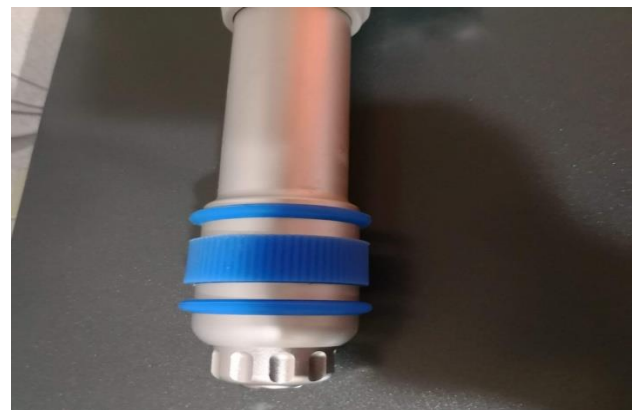
Figure 2: Handle of ESWT (clicked in the clinic orthocare).

across piezoelectric elements mounted in a sphere, which induces a pressure pulse in the surrounding water that increases to a shockwave. The expansion of each element generates a pressure pulse that enables the self-focusing of waves toward the target, creating an extremely precise focus and high level of energy. The various features of these shockwave devices like energy density, pressure distribution, and total energy at the second focal point, are used to treat a variety of diseases like musculoskeletal disorders and urolithiasis. 14 Chronic OA pain appears to be related closely to an increase in the growth of nonvascular, substance P-positive sensory nerve fibres. 15 Many studies have demonstrated the ability of ESWT to reduce OA pain. This effect is because of the neovascularization, and by repairing inflamed tissues via tissue regeneration. In a previous study, Ochiai et al applied treatment to the medial sides of knees in a rat model of OA. 16