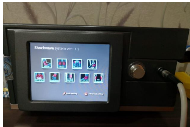
Figure 3: Shockwave system (clicked in the clinic orthocare).