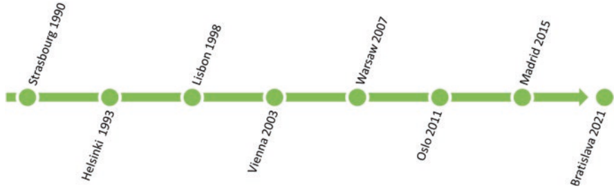
Fig. 2.3 Forest Europe Ministerial Conference on the Protection of forests in Europe (Former MCPFE) timeframe. The eighth Ministerial Conference will take place in April 2021 in Bratislava (Slovakia)

forest management concerns. The Pan-European C&I for SFM are collected in a harmonized way, are broadly accepted by policy makers, cover the most important forest ecosystem services, and are publicly available. This makes them a suitable basis for further development toward an indicator set for the assessment of CSF at a European scale.