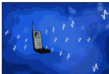
Figure 2: Wireless Transmission Using Coded Pulses.

PulsON™ promises new forthcoming patents, methods, and applications, but more significantly informs us on how to use the spectrum of available communications frequencies. In applications, it does not require an assigned frequency or a power amplifier and requires a very low-power signal (1/500 th of the energy currently needed for cellular communications). The result is a potential paradigm shift in wireless communications for local or wide area applications. A handful of strategically significant issues have threatened to undermine the commercial evolution of PulsON™ and although Fullerton and Time Domain have made significant progress, several barriers remain (Aiello and Rogerson, 2003).