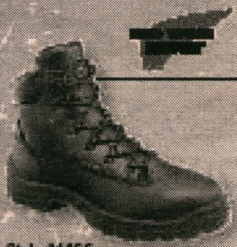
6" WORK BOOT

Choose from our huge selection of Red Wing, WORX, Irish Setter and Casual footwear and SAVE BIG during our big fall sale.