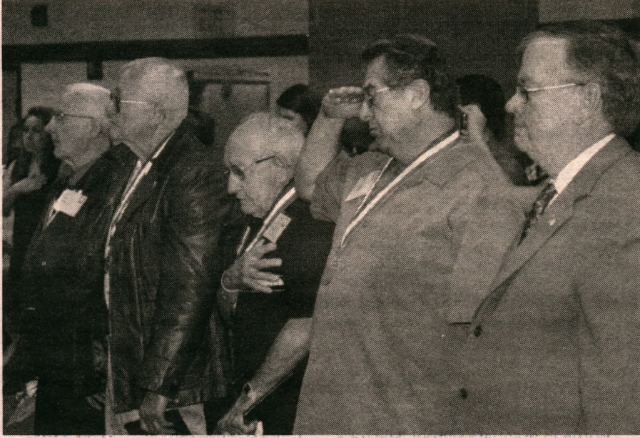
Veterans from WWII, Korea and Vietnam-era wars salute during Operation Recognition at the Riverside County Office of Education, which honors veterans with high school diplomas they missed due to military service.

The Riverside County Office of Education (RCOE) awarded high school diplomas to 17 veterans of World War II, Korea and Vietnam-era wars, noting their sacrifice and service in its annual Operation Recognition Ceremony.