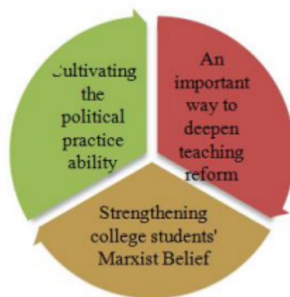
Fig. 1. The importance of practical teaching in ideological and political courses.