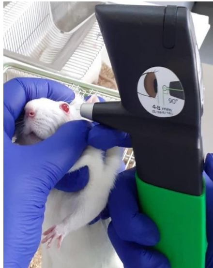
Figure 2: Measurement of IOP