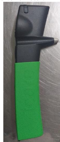
Figure 1 : iCare Tonovet rebound Tonovet tonometer

The iCare Tonovet tonometer is a non-invasive IOP measurement tool that uses a probe that propagates perpendicular to the cornea using a solenoid. The device has 3 modes of operation "h", "d" and "p" for horses, dogs / cats and other species, respectively. In the case of our study it was set to "p" mode and was used according to the manufacturer's instructions. The equipment was set to calculate the average of 6 consecutive IOP measurements for each eye. At the beginning of the experiment, all the animals were examined ophthalmologically, and a single examiner performed the workmanship for measuring the IOP. Every day 0, day 44 and day 70 of the experiment, the animals were handling by an operator, and the examiner, measured the IOP keeping the device pointing perpendicular to the cornea. The final IOP value indicated by the device represented the average of 6 consecutive measurements. The IOP measurement surgery was performed 3 times, at same times of the day, and at the end of the study, no animal showed corneal lesions or other conditions following the use of the Tonovet rebound tonometer.