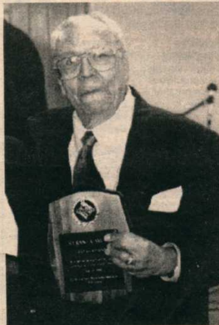
Lalo Guerrero, legendary musical star and composer (above) receiving the California Chicano News Media Association's Esperanza Award at the 10th Annual CCNMA Scholarship Dinner at the University of California, Riverside, May 15.