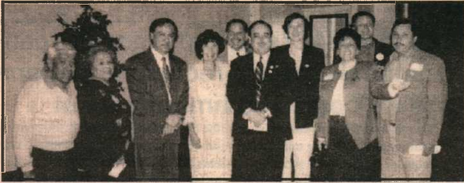
Cruz Bustamante, center, former Assembly Speaker and candidate for Lieutenant Governor, was a guest speaker at the Zacatecas Restaurant, Riverside. Bustamante spoke to a large group of activists, reviewing his political background and discussing critical state issues. There was a question and answer session during the three hour reception.