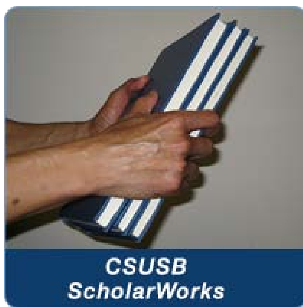
The new CSUSB ScholarWorks button on our website.