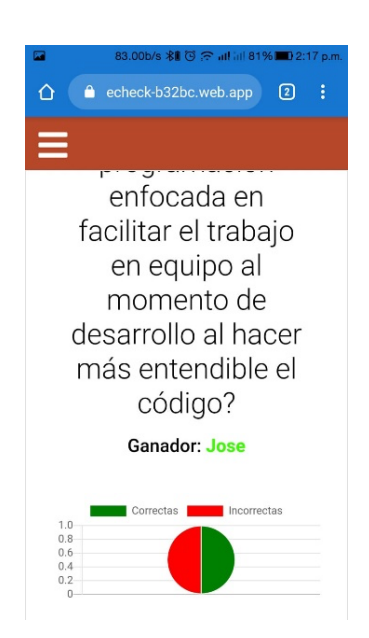
Figure 6. Interface of a question in a teacher view.