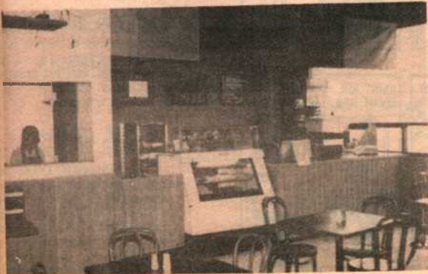
The Snack Bar