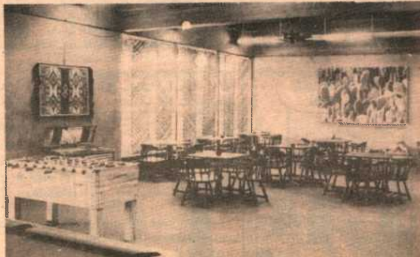
The Pub & Game Room