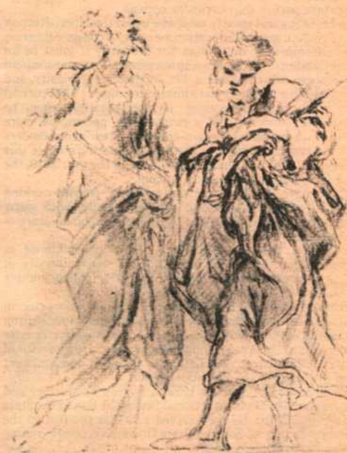
Two Saints, c. 1646, one of eighty-one drawings by Gianlorenzo Bernini, will be on view through March 14 at the Los Angeles County Museum of Art.

The series is supported in part by a grant awarded to the L.A. Center for Photographic Studies by the National Endowment for the Arts, a federal agency. Additional support has been provided by the Graphic Arts Council of the museum. Tickets for students with I.D. will be $2 at the door.