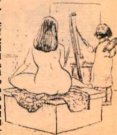
Girl unsuited for her work