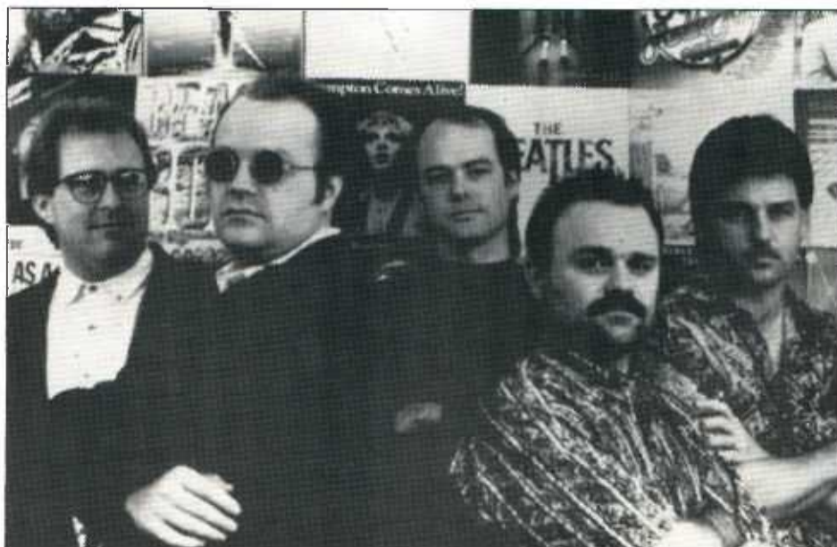
Alan Munde and Country Gazette