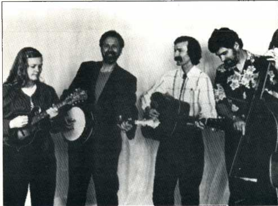
The LCR Band

Both concerts are free and begin at 7 p.m. on the Lower Commons Plaza.