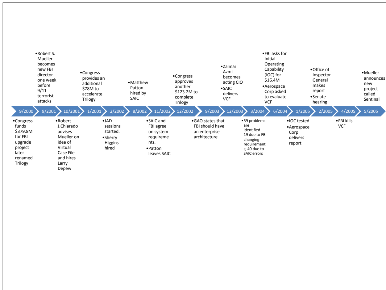
Figure 2: Timeline of Events (Adapted from Goldstein, 2005)

Robert Mueller stated that the new case management system will be implemented in four phases and should take about 39 months to complete. He was unwilling, however, to estimate how much the new system will cost (Rosencrance, 2005).