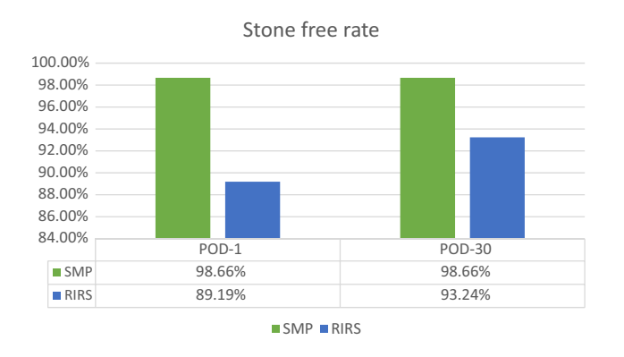
Fig. 1 Comparison of stone-free rate in the two study groups

The inclusion criterion was a single renal stone of maximum diameter of \leq 2 cm or multiple stones with a maximum cumulative diameter of \leq 2 cm in the same calyx not needing another puncture. The stone size was defined as the maximum diameter as determined by non-contrast CT. Exclusion criteria were patients aged < 18 years, uncorrected coagulopathy, on antiplatelets or anticoagulants, and active urinary tract infections.