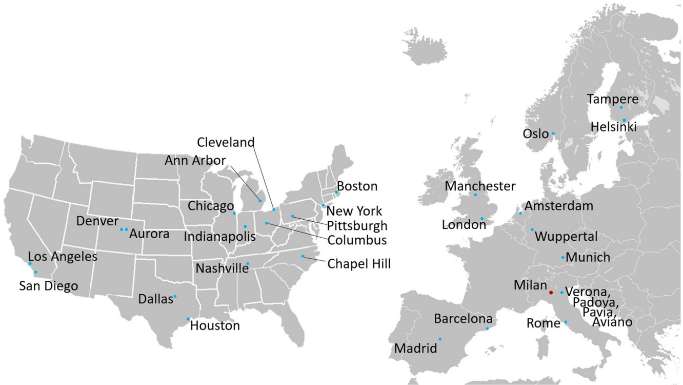
Supplementary Figure 2. Geographical distribution of participating centers. Red, site of the coordinating center. Blue, sites of the participating centers.