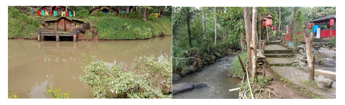
Figure 1. The Transformation of Space in One of the Tours

In addition, the advent of migrants who purchase and rent land from local society, conducting spatial practices, has shifted the definition of space representation. Besides, the representational of space transformation is inseparable from the spatial conflicts between migrants and local society. The dispute emerged due to the land conversion, in which fertile land with an integrated agricultural system was converted into built-up territory with concrete and asphalt construction. Particularly, the dispute was induced by society's concern about increasing disaster potential due to the loss of land cover vegetation. Besides, the spatial conflict was exacerbated by the contrast between the land function conversion and local wisdom that the community has believed for generations. Finally, the migrant slightly commodified the representation space by involving local society in the space. The results of the space production are illustrated in Figure 1.