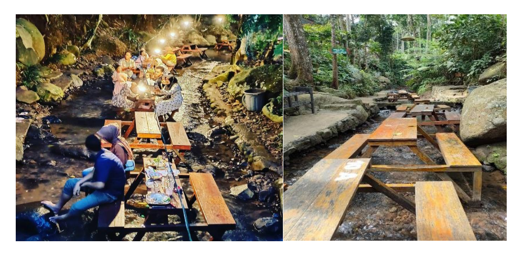
Figure 2. Attraction of the Sumber Biru Tourism

The changing identity of the Anjasmoro mountain flank area from an agropolitan area to a tourist destination exemplifies a representation of the space created by migrants. Within the area, we observed some types of tourism, most of which utilize springs and rivers in the area. One of the attractions produced by the local society is Biru Spring. Space production was carried out by changing the function of the upstream border of the river from its primary function into its tertiary one. The tertiary function was realized by constructing a café upstream of the river where tourists can enjoy food while playing water in the river. Prior to becoming a tourist destination, the river border was a closed area abandoned by the local community. The head of the Biru Spring tourism management explained that their tour was established following the perceived and lived space of the migrant, which later was discussed with the local community and manifested into spring tourism (Wahyudi, 2021). The subject also explained that he and the local community tried to deconstruct the river's landscape by widening the river and constructing an artificial dam to enhance its aesthetic and generate a high discharge when the tour was opened. The illustration of Biru Spring is presented in Figure 2 and figure 3.