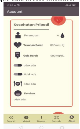
Feature 1. Account at Application dokterkit

Based on the requirement of the chatbot platform, data to be collected and used in this work include physiological information like blood pressure, heart rate, and BMI by measurement at smart mobile phones. Captured data is stored, enriched, then semantically fused to enable a unified and unique data access interface.