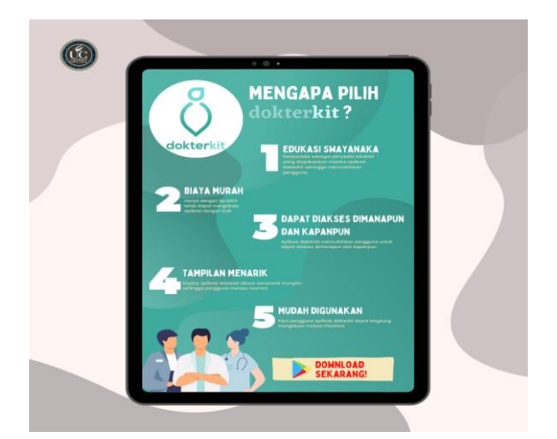
Feature 3. Promotion Application